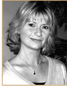
by Tamra Mueller, Designer

What kind of theme room is hiding in your basement? It just might be time to turn those unused guest bedrooms into that special get away. ✨